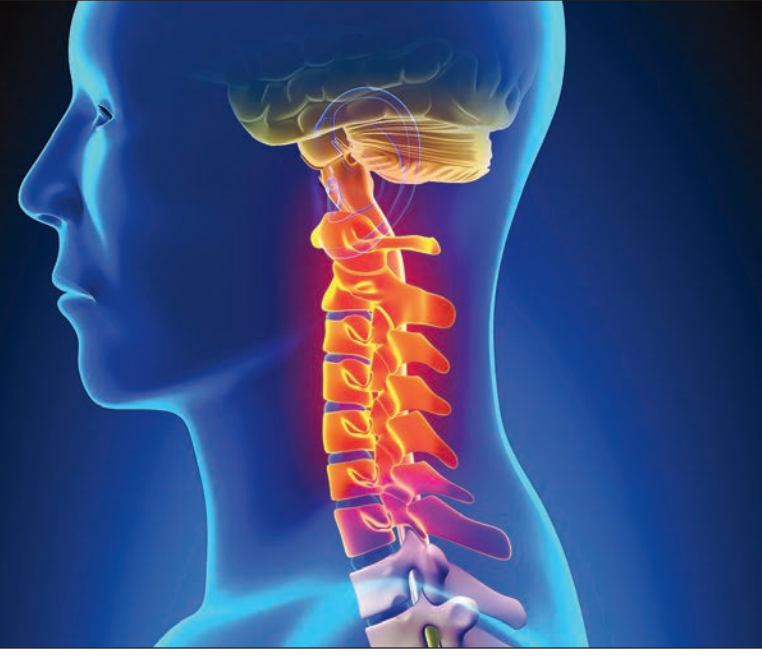
The findings demonstrate that outcomes, including cost effectiveness, are better with an active approach to physical therapy.

Seventy patients classified as Grade 2 randomly were