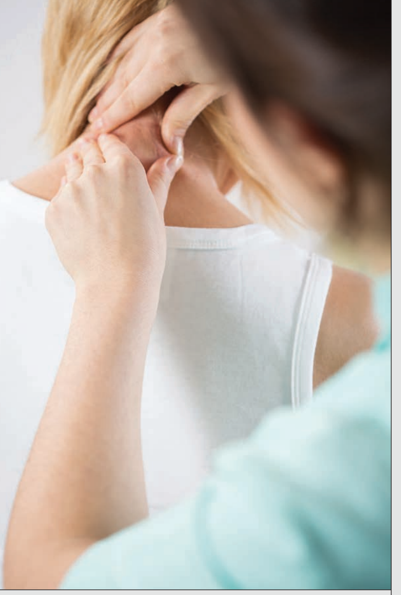
The 42-year-old female patient's musculoskeletal treatment included cervical and thoracic manual techniques.

Because of her dizziness, a vestibular examination was performed. She tested positive for reduced oculomotor function (eye muscle coordination) and poor balance, especially on uneven surfaces.