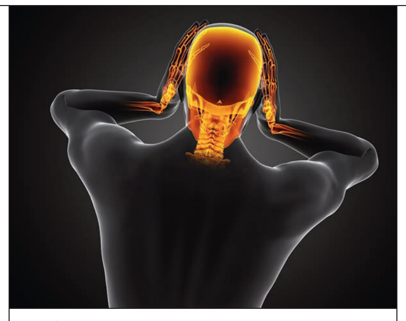
What feels like a dull, achy pain in the head really has its roots in the neck.

The first part of "cervicogenic" refers to the cervical