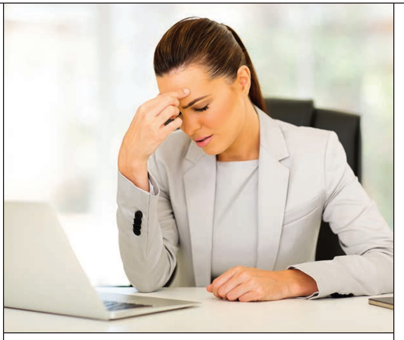
She was unable to look at the computer or read for more than 30 minutes without a headache occurring.

Analysis of the patient's posture revealed a forward head, rounded shoulders, and increased thoracic kyphosis (rounded mid-back). Cervical